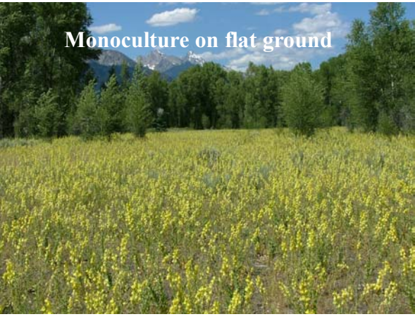
Monoculture on flat ground