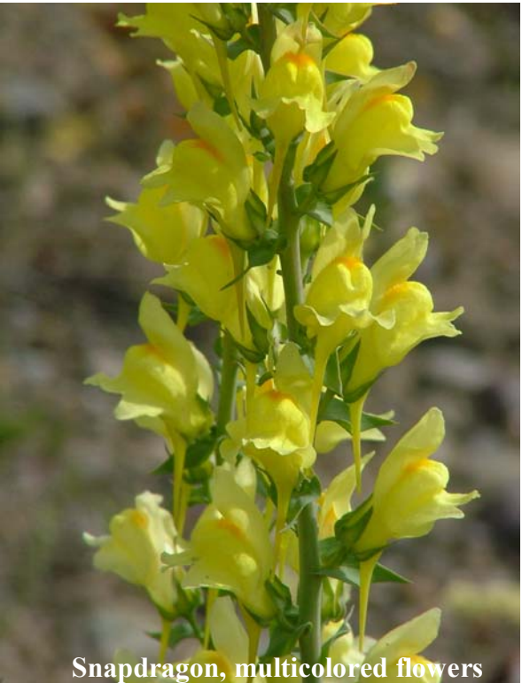
Snapdragon, multicolored flowers