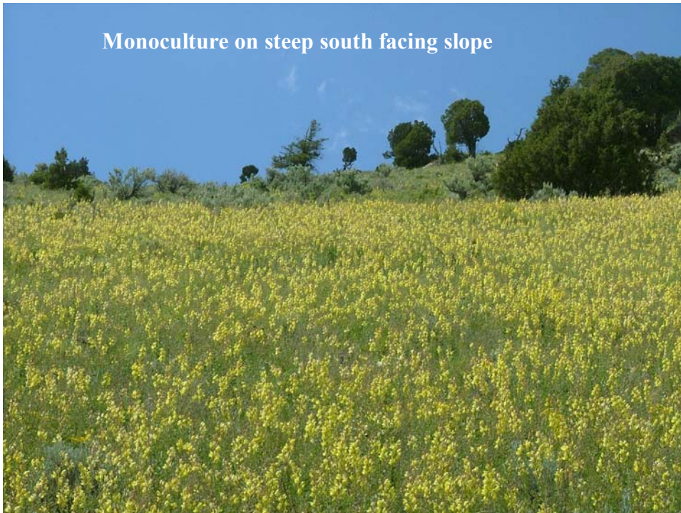
Monoculture on steep south facing slope