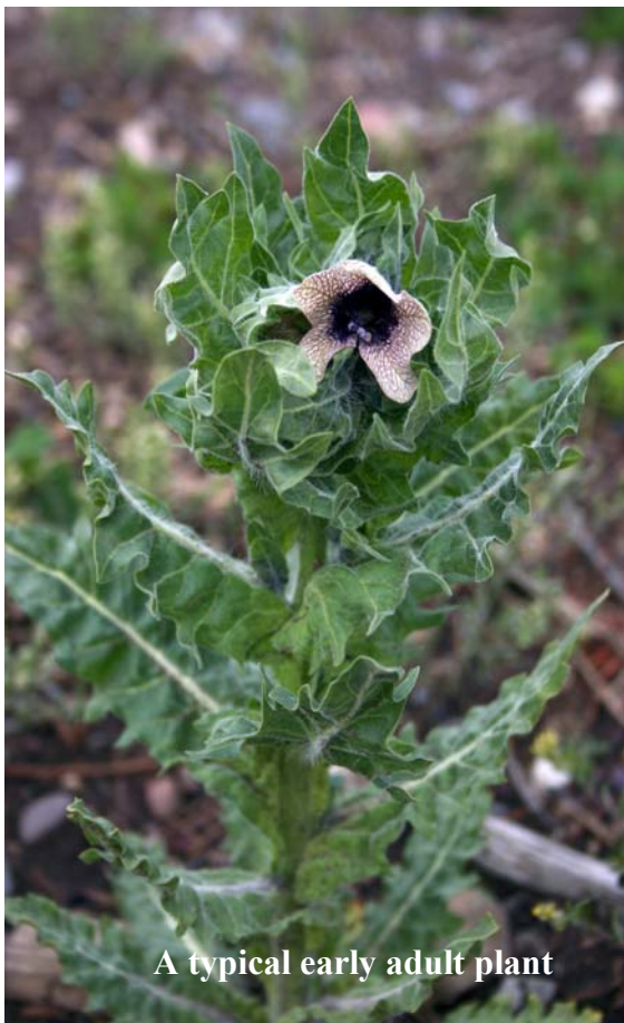
A typical early adult plant

This plant invades disturbed soils and has very fine seeds that travel very well in muddy equipment. This plant is fairly cyclical in its nature and is more of a nuisance in Teton County. If found on your property or for control options please contact Teton County Weed and Pest District 733-8419.