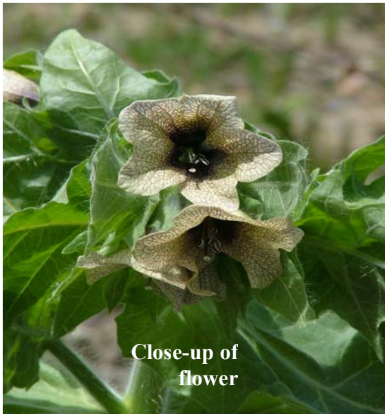
Close-up of flower