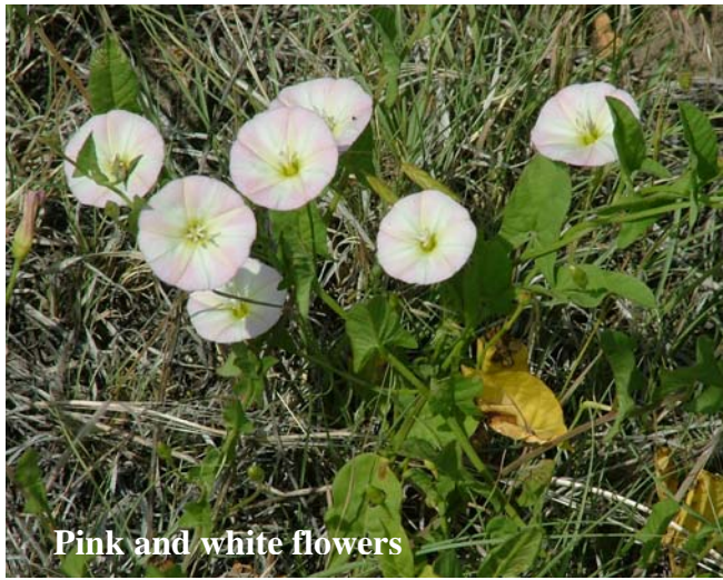
Pink and white flowers