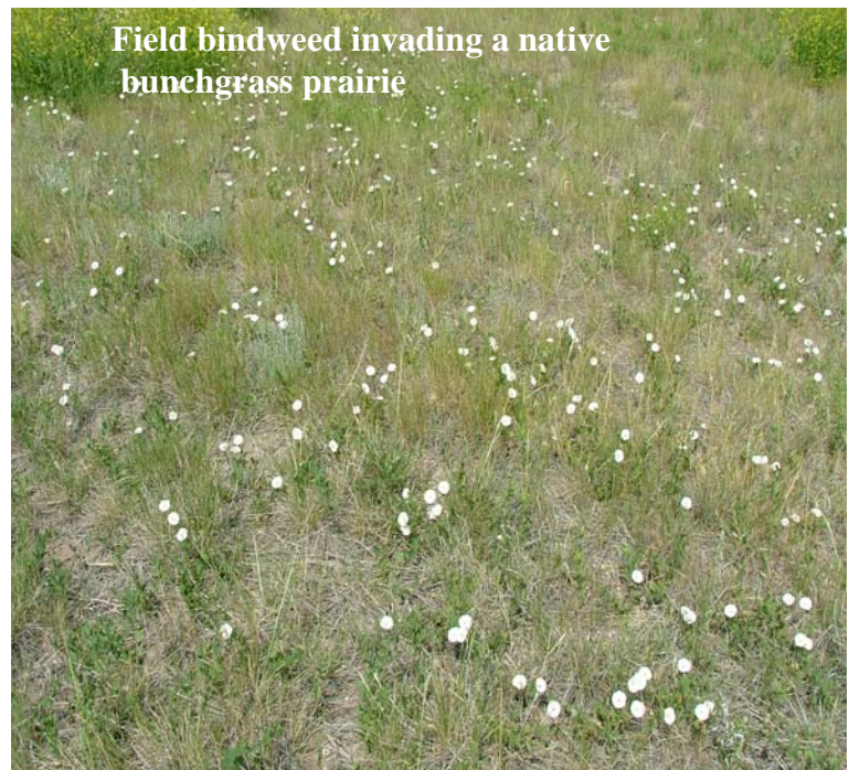
Field bindweed invading a native bunchgrass prairie