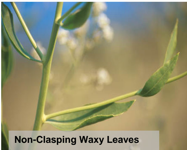
Non-Clasping Waxy Leaves