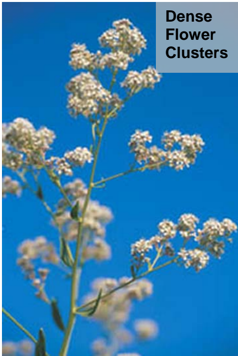
Dense Flower Clusters